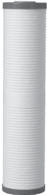
AP810-2 / AP811-2